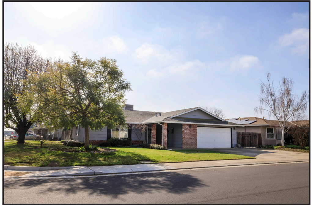
3 Bedrooms 2 Bathrooms 1593 Square Feet on .2006 Acre