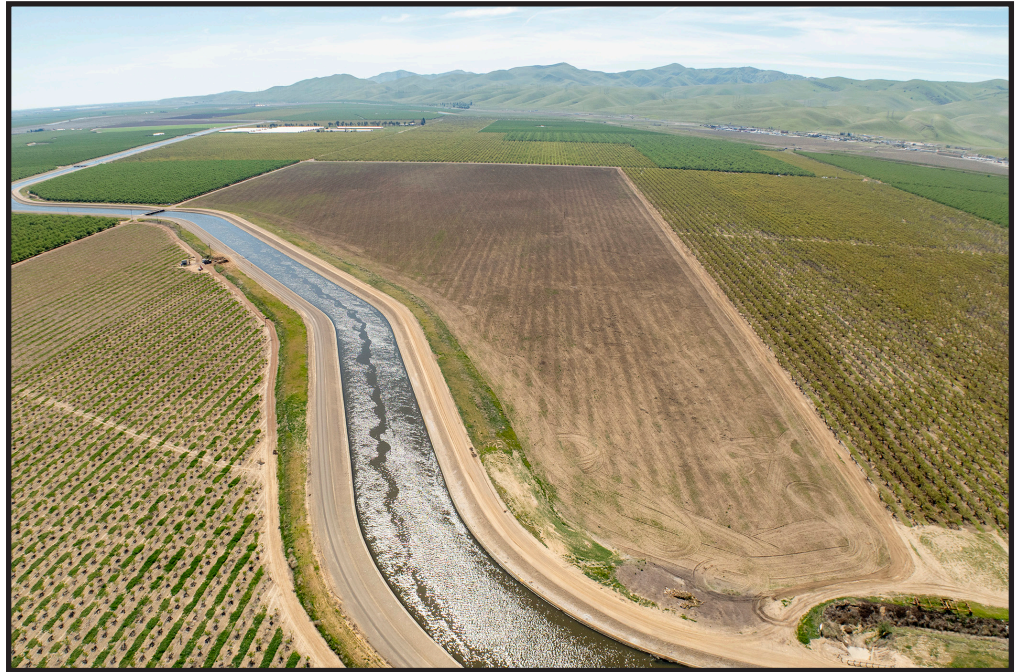
McCracken Road Ranch Westley, CA - For Sale - 199± Acres