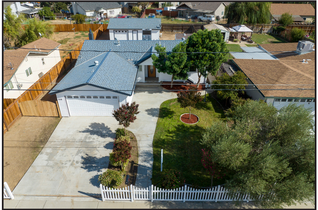
4 Bedrooms 3 Bathrooms 2016 Square Feet Includes ADU