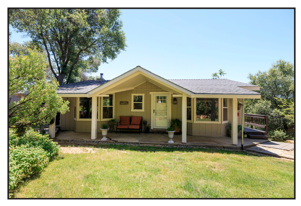
3 Bedrooms 2 Bathrooms 1972 Square Feet on 2.16 Acres