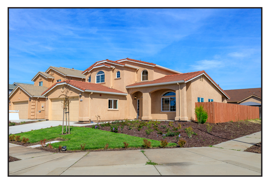
5 Bedrooms 3 Bathrooms 2239 Square Feet on .138 Acres