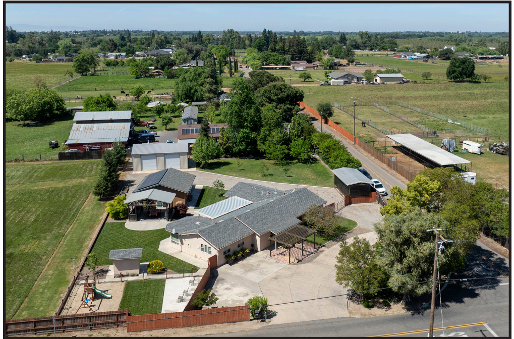
3 Bedrooms 2 Bathrooms 2100 Square Feet on 1.99 Acres